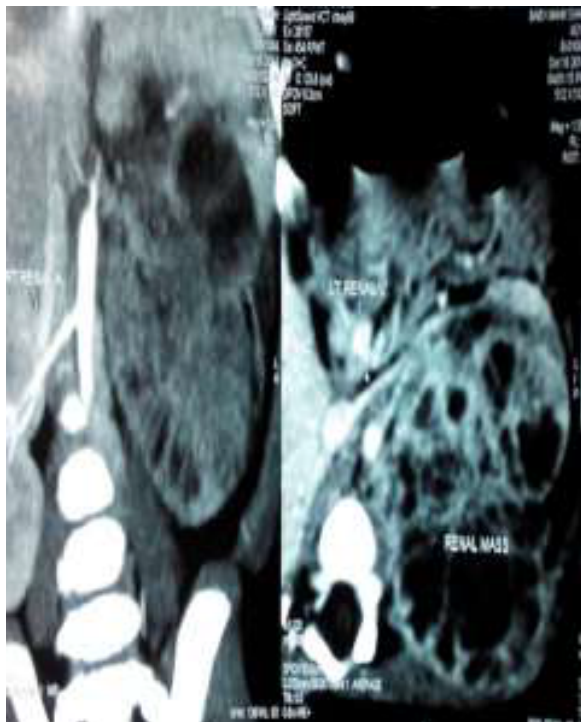
Figure 1 CECT (coronal view).