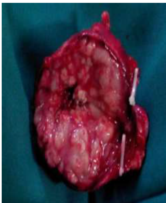
Figure 2 Cut section of specimen.