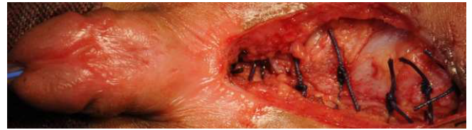
Figure 2 Excised dry exstrophied bladder mucosa with closure of abdominal wall defect.