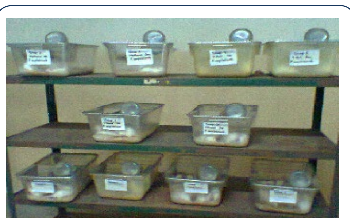
Figure 2 Mice sorted for assessment of hepatoprotective activity.

ALP is present in hepatocytes plasma membrane and elevation in ALP level is related directly to the damage in liver cell membrane