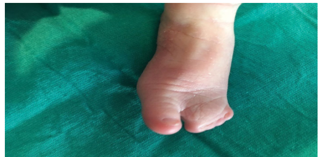
Figure 3 Syndactyly of the lower extremities.