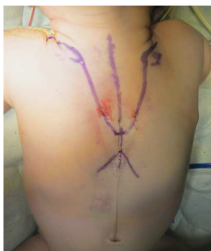
Figure 3 Vertical incision on the midline and anatomic marks.

Many authors agree to say that primary repair is best accomplished in the neonatal period, benefiting from of the pliability of the chest wall and less compression of underlying structures. If signs of mediastinum compression appear during surgery, primary repair should be terminated for a more elaborate approach (sliding or rotating chondrotomies, pectoralis major myoplasty, clavicular fracture, or even autologous tissue flaps, myocutaneous flaps, prosthetic materials) [5,8,9].