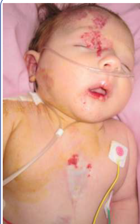
Figure 1 Facial and thoracic hemangiomas and superior sternal cleft with supraumbilical raphe.

Surgical correction was performed in 3 of them. During primary closure, none signs of compression of the mediastinum appeared. None intra-operative complications occurred. Near infrared spectroscopy indices stayed normal and regular all along the surgeries. Mean operative time was 120 min (100-150). In cases of upper sternal cleft, primary closure was performed at 5 and 10 week-old respectively. In complete sternal cleft, prosthetic closure was done at 14 days-old, and the primary repair was done seven months later. In cases of lower sternal cleft non-surgical